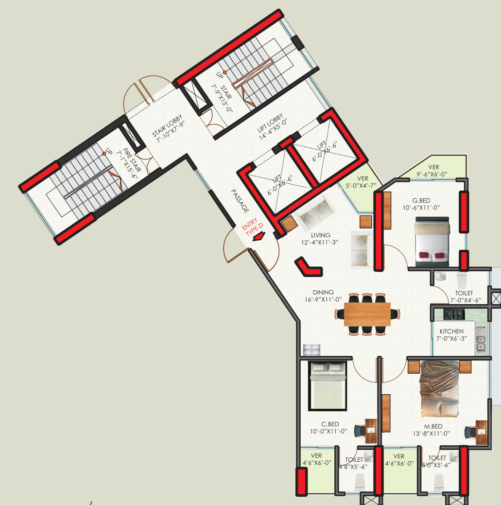
TYPE-D Area-1,272 sqft. (Gross)