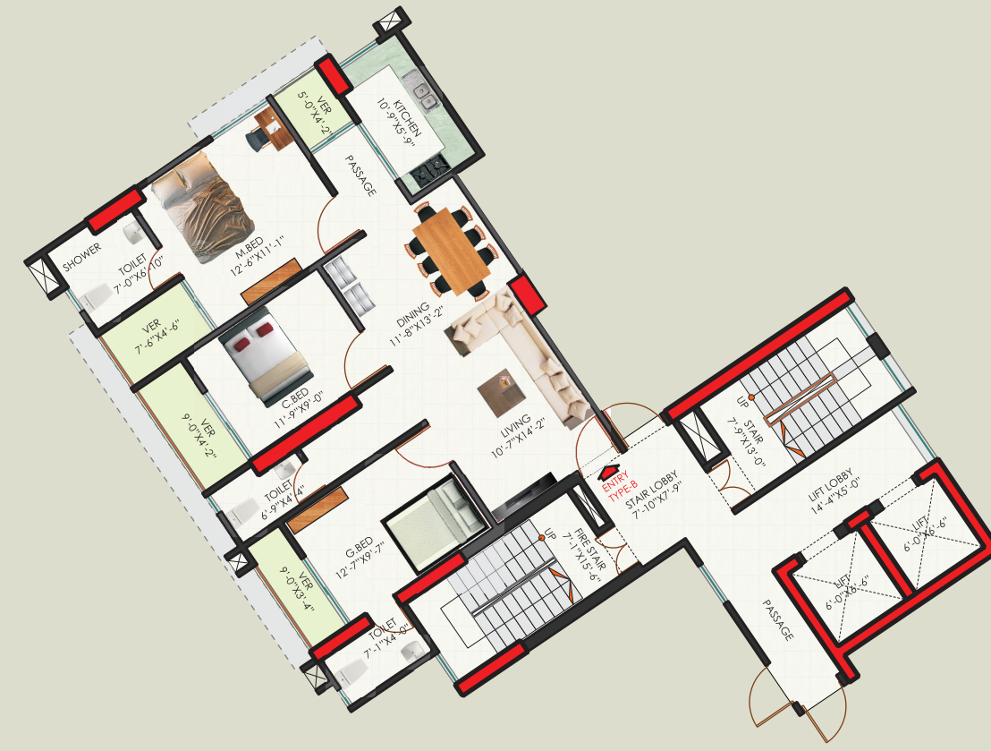
TYPE-B Area-1,357 sqft. (Gross)