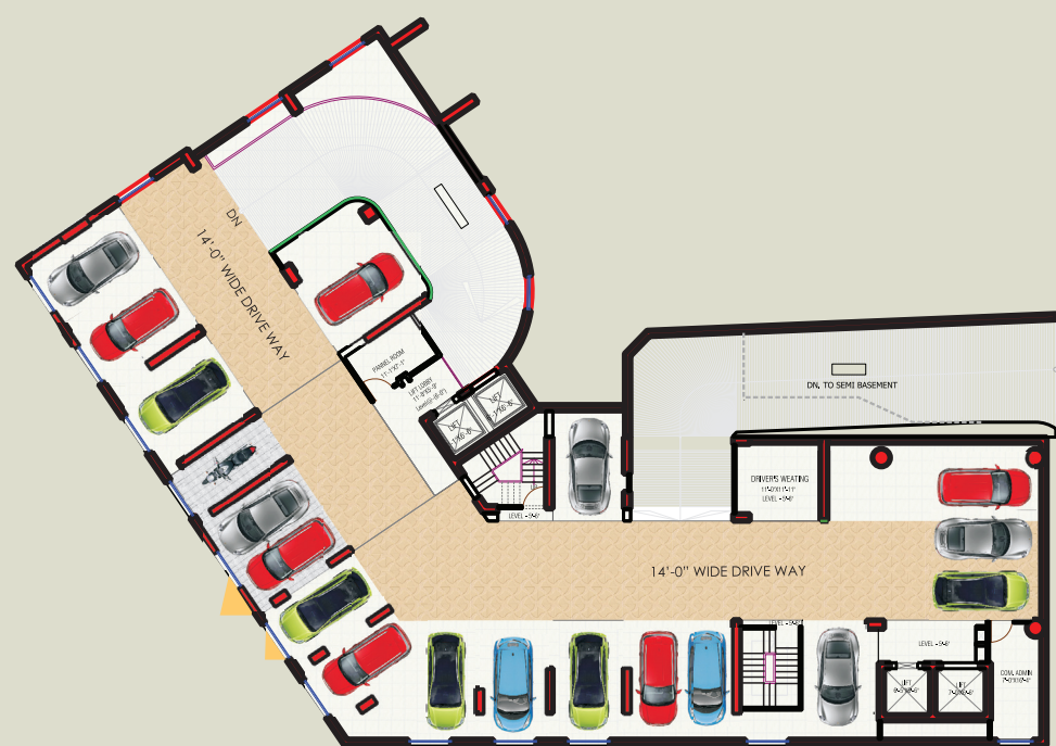
BASEMENT-1 Car parking-18 nos