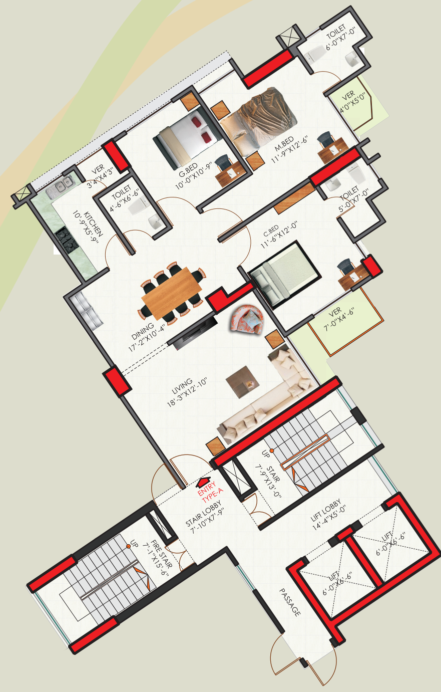
TYPE-A Area-1,436 sqft. (Gross)