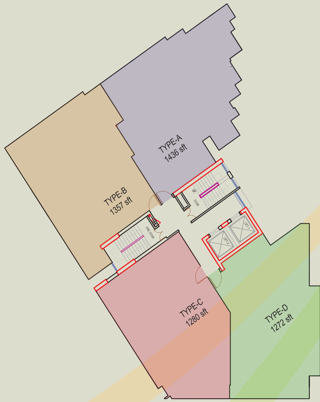
5TH TO 10TH FLOOR PLAN