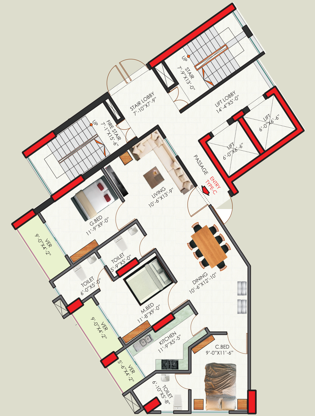
TYPE-C Area-1,280 sqft. (Gross)